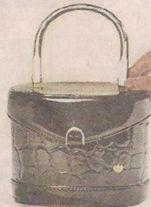
Black handbag, $ 3.99.