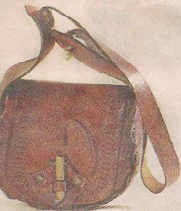
own leather rse, $3.99.