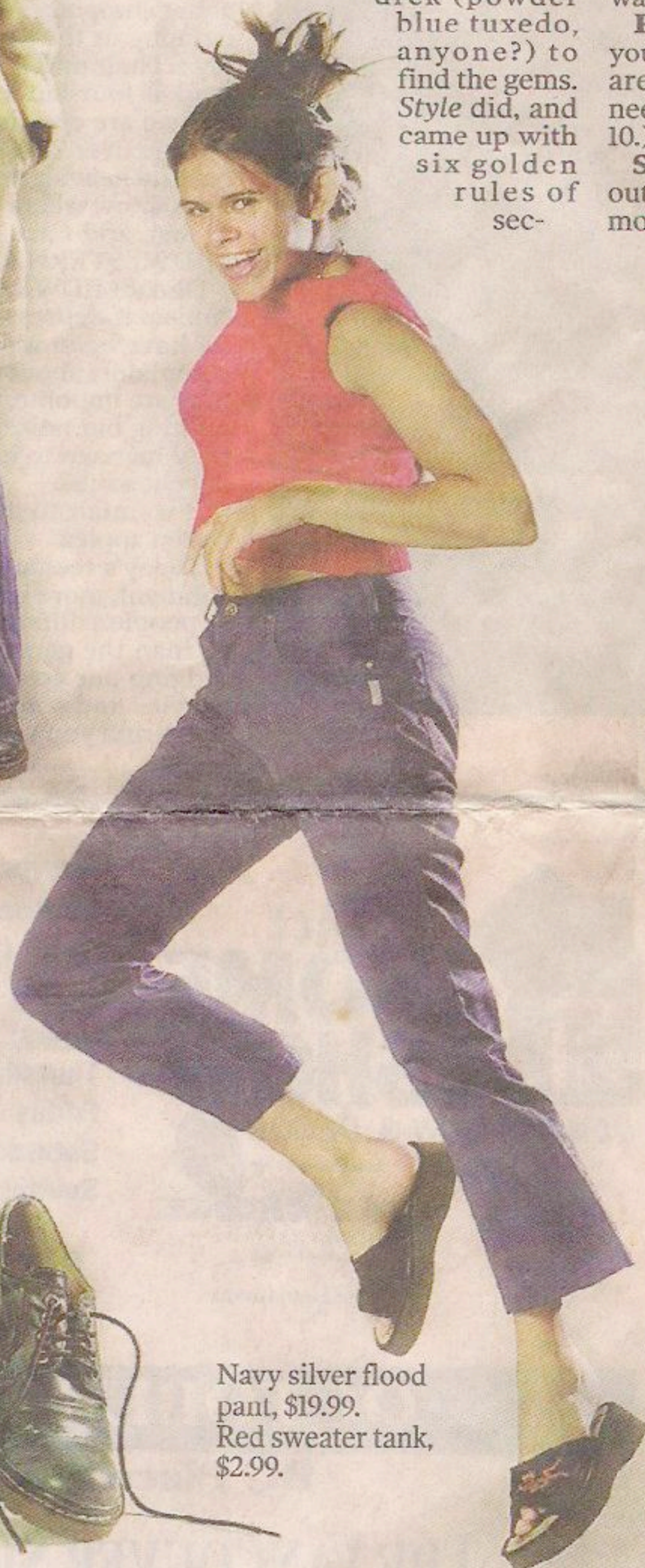
Navy silver flood pant, $19.99. Red sweater tank, $2.99.